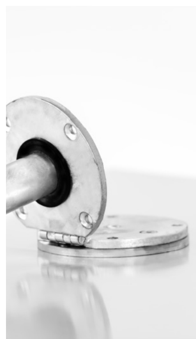
HINGED SPIGOT INSTALLATION