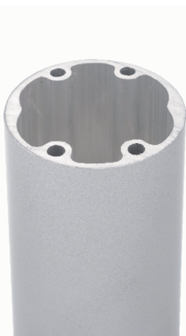
STRENGTHENED EXTRUDED ALUMINUM MAST

Umbrellas comparable to the Nova in size and weight almost always require a permanent installation. The Nova is one of the only large shade structures in the industry with a semi-permanent and non-permanent mount available. This umbrella not only looks spectacular, but can be mounted on any surface for multiple commercial applications.