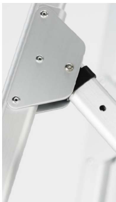
DOUBLE REINFORCED JOINTS