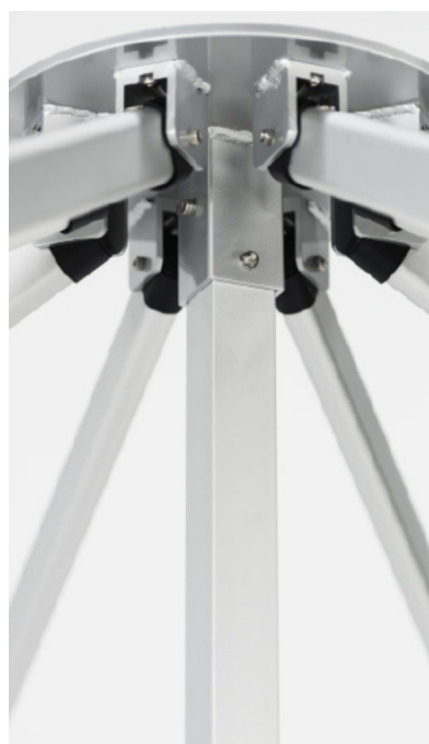
TELESCOPING CRANK SYSTEM