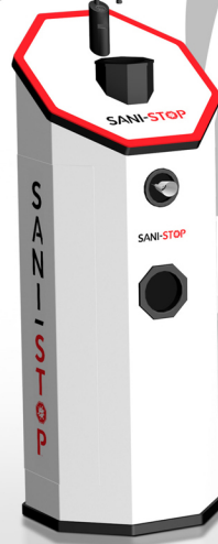
SENTRY with Hand Pump Dispenser