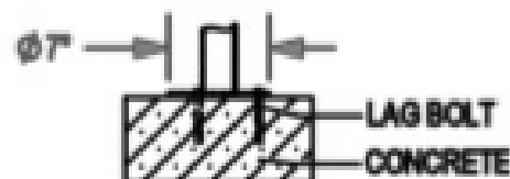
□ SURFACE FLANGE MOUNT (SF)