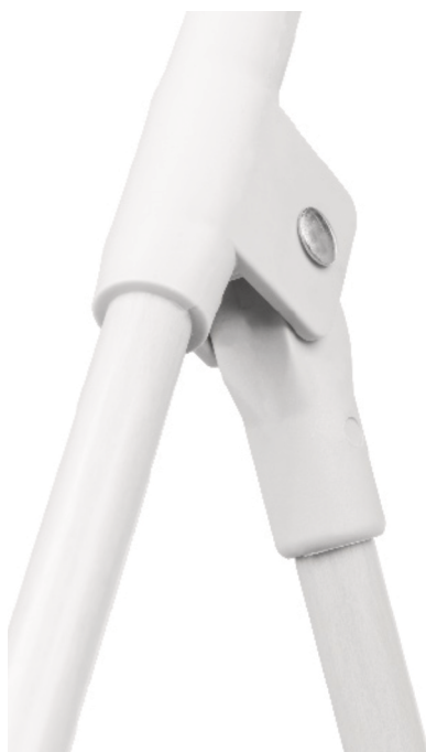
FLEXIBLE FIBERGLASS FRAME