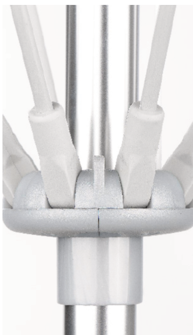
1.5" DIAMETER CENTER POLE

We use a stainless steel grommet at the top of the notch to keep the fabric in place and prevent rust stains. This exceptional umbrella will perfectly complement any outdoor setting!